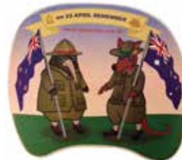
Kangaroo with Kiwi and Flags