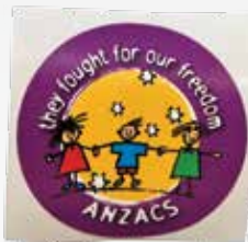
ANZAC Kinda stickers (rolls of 50)

Available to ex-service organisations only.