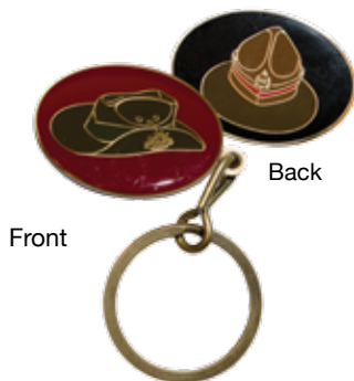
ANZAC double sided keyring