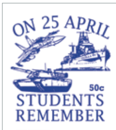
Students Remember Tri Service Sticker

This bright and fun children's tattoo is approx 50mm X 30mm in size. Clear instructions for application are printed on the tattoo carrier sheet.