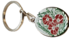
Poppies & Rosemary