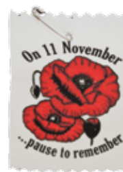
Poppy 11 November