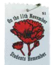
Students Remember Poppy