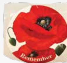
Poppy Kinda sticker (rolls of 50)