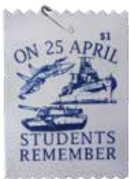
Students Remember Tri Service

The non adhesive Ribbons are supplied with small safety pin for easy application.