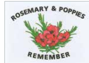
Rosemary and Poppies