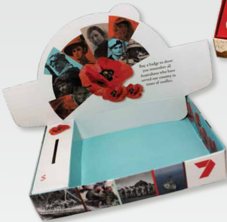
Point of Sale Tray Generic (Small) 140mm X 200mm