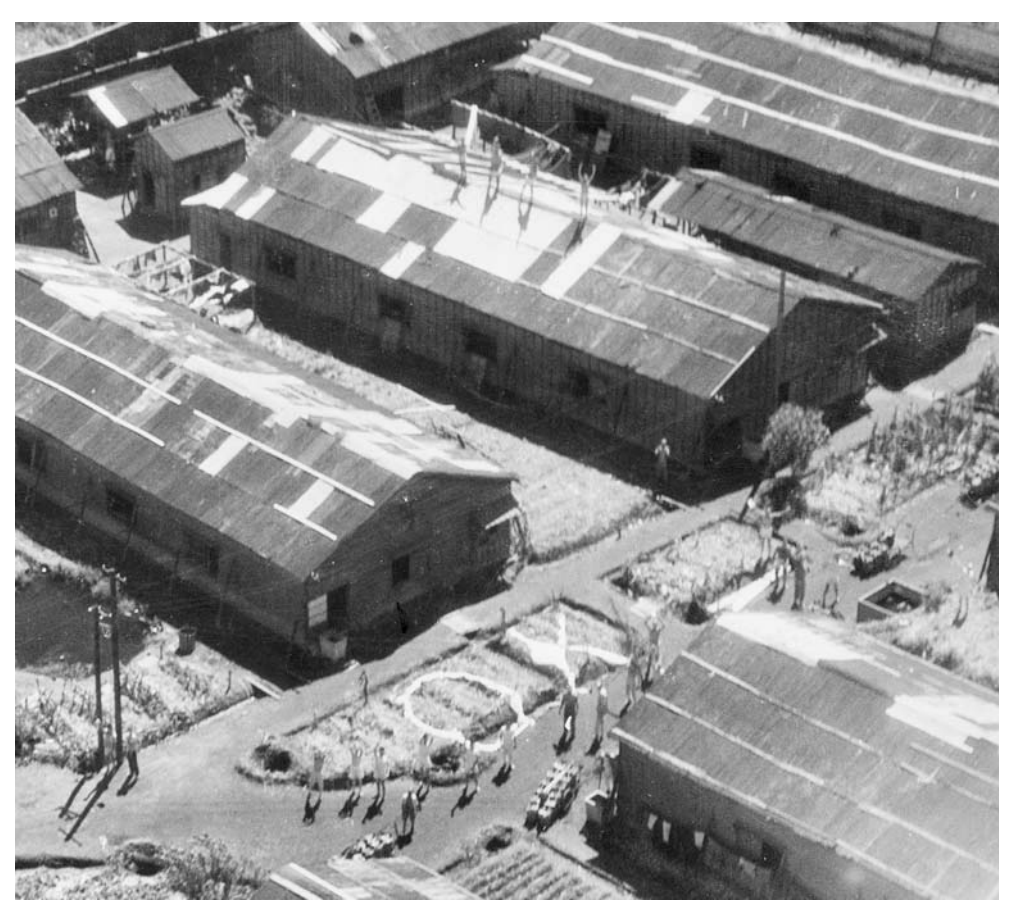
Yokohama, Japan. August 1945. Aerial view of a Prisoner of War Camp where Allied Prisoners of War have made the letters OK in their compound from pieces of material as an indication of their condition.