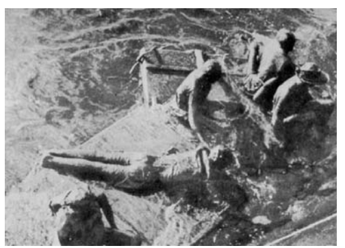
A raft reaches Pampanito.