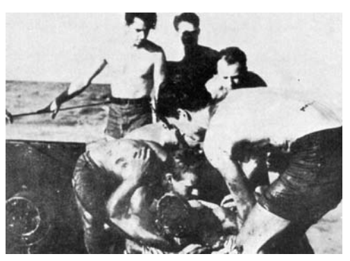
Pampanito topside crew gently lowers a survivor to the deck.