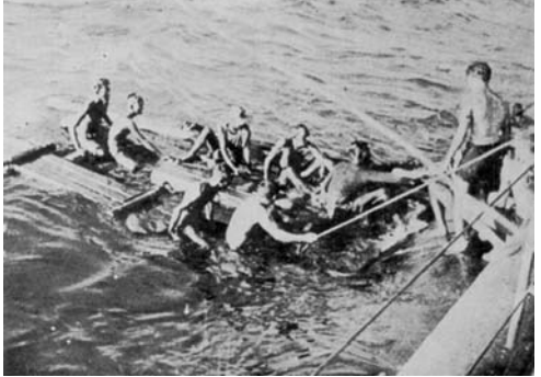
Pampanito crew prepare to take aboard more survivors.