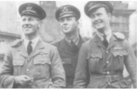
(London Daily Mail 1919)