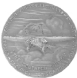
"The Southern Cross: England-Australia. Trans Tasman. Trans Pacific. Trans Atlantic' (Museum of Victoria)