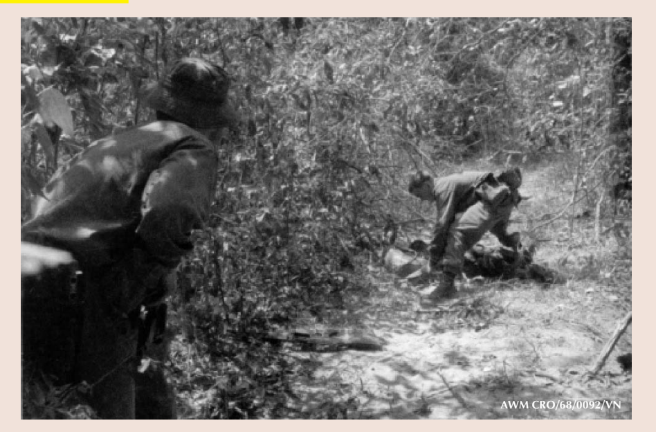
A wounded man on a patrol