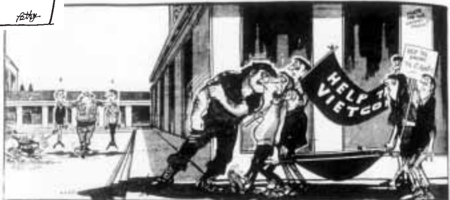
'You'd better start praying that the VC send some help back, sonny!' ↻