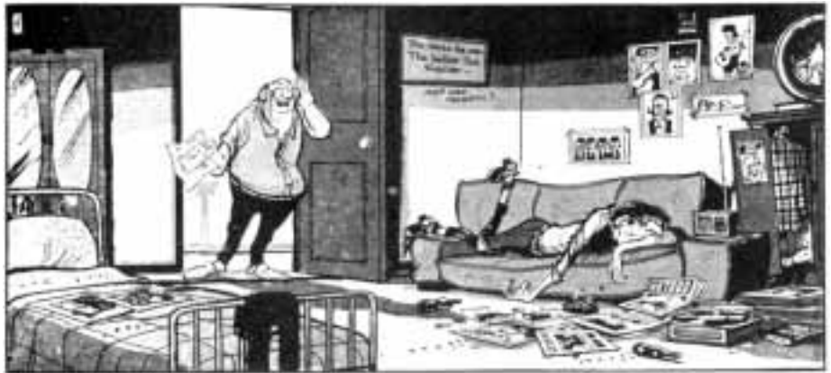
'Ballot day for National Service: "Lo! The smell of battle in the air and sounds of distant musketry . . . 'tis the call to arms!! . . .'" Cartoon by Rigby ↻