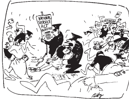
↻ 'A great time to start searching your conscience!'