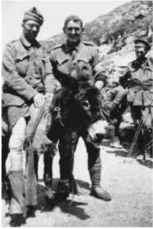
Simpson and his donkey

A symbol can be a powerful thing, but symbols often distort the reality behind them. This can be a disservice to the person, as their humanity is being displaced by a falsehood. The issue for you to decide here is if the symbol of Simpson is true to the reality of the man himself.