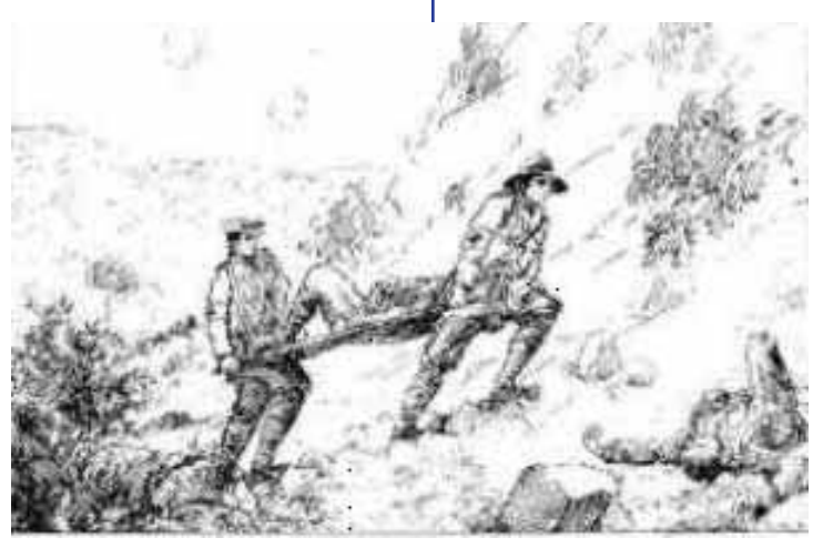
Sketch by Ellis Silas, 'Stretcher-bearers in action at the head of Monash Valley" (Tom Curran, Not Only a Hero, ANZAC Day Commemoration Committee of Queensland,

"The transportation of the wounded to the beach was in itself a nightmare even when the stretchers were used, but [where stretchers were not available] oil sheets had to be used. Then [for the bearers] — slipping and sliding down the steep hillside, their hands cramping from the insecure hold upon the corners of the sheet, the heavy shrapnel fire continuously above them, and a persistent urge to halt — if only for a few seconds so as to ease the cramp in their hands — made the journey one long agony." (Tom Chataway in Tom Curran, Not Only a Hero, ANZAC Day Commemoration Committee of Queensland, 1998 page 34.)