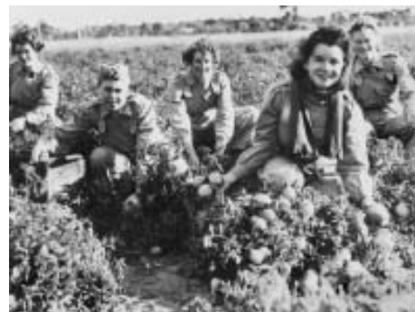
AWM 014929. Australian Land Army girls doing their bit to assist in the war effort. They are harvesting large crops of vegetables which are being canned for the troops.