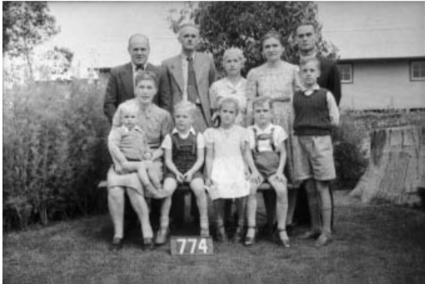
AWM 030242/13. Family groups of German Internees at No. 3 Camp, Tatura Internment Group.

Q. 46 Discuss the pros and cons of interning the whole family of 'enemy aliens' (see the photograph below).