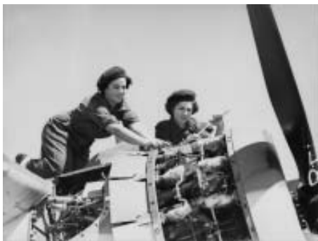
AWM 029692. Members of the Women's Auxiliary Australian Air Force cleaning and overhauling a plane of the RAAF.