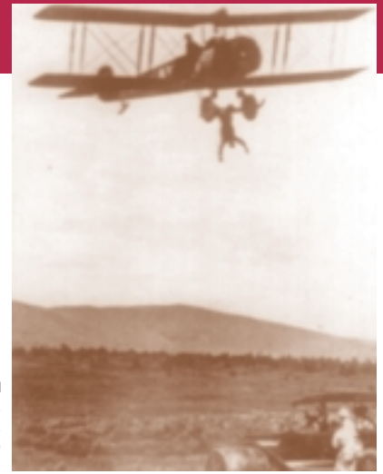
(National Air and Space Museum, Smithsonian Institution, Washington 1919)