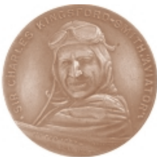
'Sir Charles Kingsford-Smith Aviator' (Museum of Victoria)