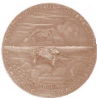
'The Southern Cross: England-Australia. Trans Tasman. Trans Pacific. Trans Atlantic' (Museum of Victoria)