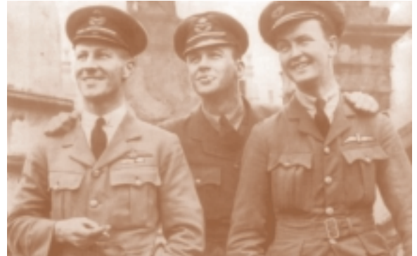
(London Daily Mail 1919)

7 Discuss which of this information might be most relevant in your understanding of Smithy, and how you might present some or all of this information in the display you are creating about him.